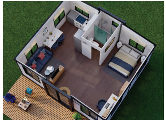
Shown: Open plan: L shaped kitchen. Scan QR code below to view all floor plans.