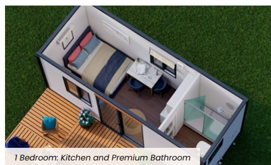
1 Bedroom: Kitchen and Premium Bathroom