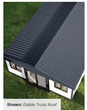
Shown: Gable Truss Roof