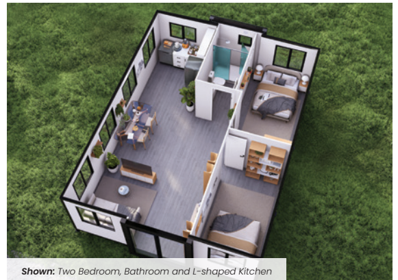
Shown: Two Bedroom, Bathroom and L-shaped Kitchen