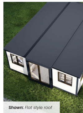
Shown: Flat style roof

1 Due to the extremely flat roof of the 2.4m high ceiling model it is required to add an angled roof over the whole home on installation to ensure water leakages don't arise. Ask about our Gable Truss Roof option, or you can choose to install your own.