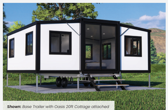
Shown: Base Trailer with Oasis 20ft Cottage attached

*The My Little House range of relocatable homes are designed and sold to be mounted on an ADR approved trailer for use as a registerable caravan and not sold as Class 1A Buildings. *Images may differ from actual product and are subject to change.